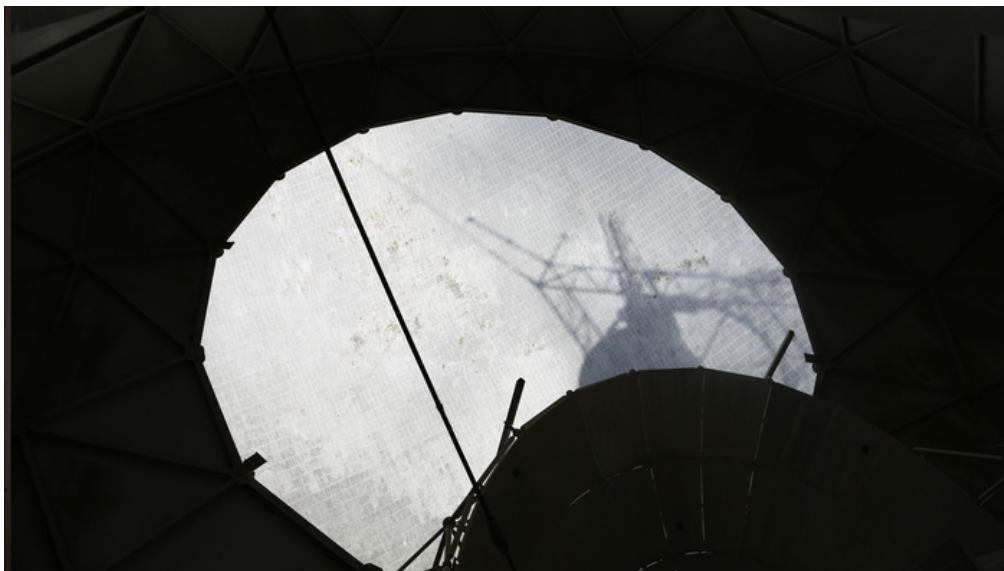
Allora & Calzadilla, The Great Silence , 2014

While the exhibition is undeniably moving in swathes, the cosmic proportions left me with a slightly uncomfortable aftertaste at times. The extreme emotional register forced the human to abstract into The Human and even as Allora and Calzadilla profess to explore of communication, I felt cut off, like an atheist watching a church service or a TV watcher of the moon landing—or worse, a little tricked by the drama. That said, I found The Great Silence (2014) to be the most interesting of the works. In a 3-channel video installation, a parrot laments how while humans obsess over finding life in space—a modern day search for God—it ignores the profuse bio-societies that inhabit earth, leading to the preset day near extinction of its kind. Not to be flippant, but in the rarified world of Intervals , I wonder: who is the parrot?