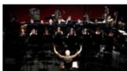
GALLERY: A season for singing out

The Opera Philadelphia season opens with Verdi's "Nabucco"; opening night will be simulcast at Independence Mall.