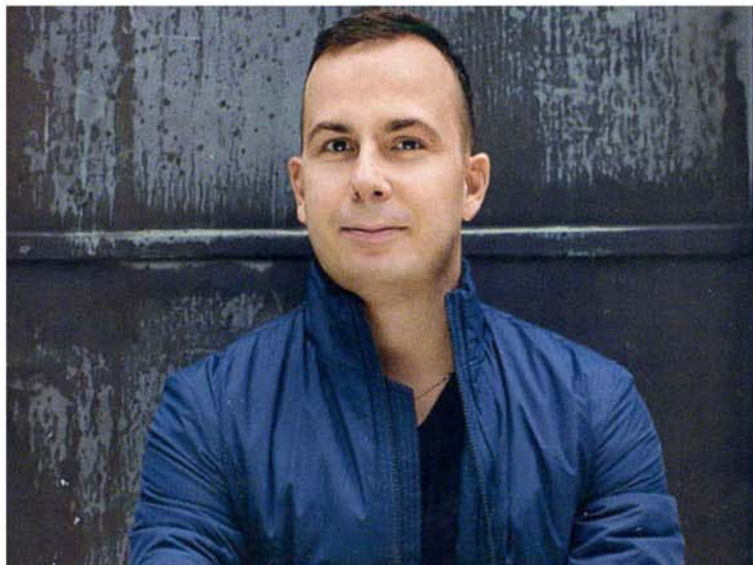
Yannick Nézet-Séguin conducts Tchaikovsky with the Rotterdam Philharmonic.