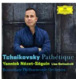
GALLERY: Philadelphians' classical richness, depth captured on discs